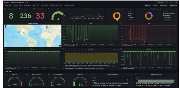
Mobile Private Network End-to-End Management Portal

Our services span business planning and network design to network and service operations. Complemented by our deployment workflow automation and mobile private network end-to-end management portal, this allows us to provide comprehensive management capabilities for effective network operations.