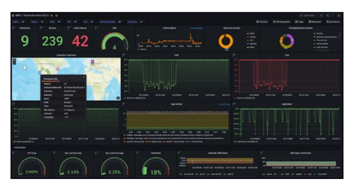
5G Core Dashboard