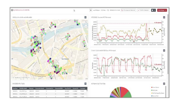
Amdocs Helix Performance Management (PM)

Amdocs Helix PM optimizes network and service performance for the effective management of the end-to-end performance and quality of service (QoS) of complex multi-technology networks. Built to process massive amounts of data using the latest in big data technology, the solution helps operations and engineering teams identify network traffic patterns, predict potential failures and plan for future network expansions. This is further enhanced by advanced algorithms that automatically detect network anomalies and utilize adaptive thresholds to better monitor KPI trends.