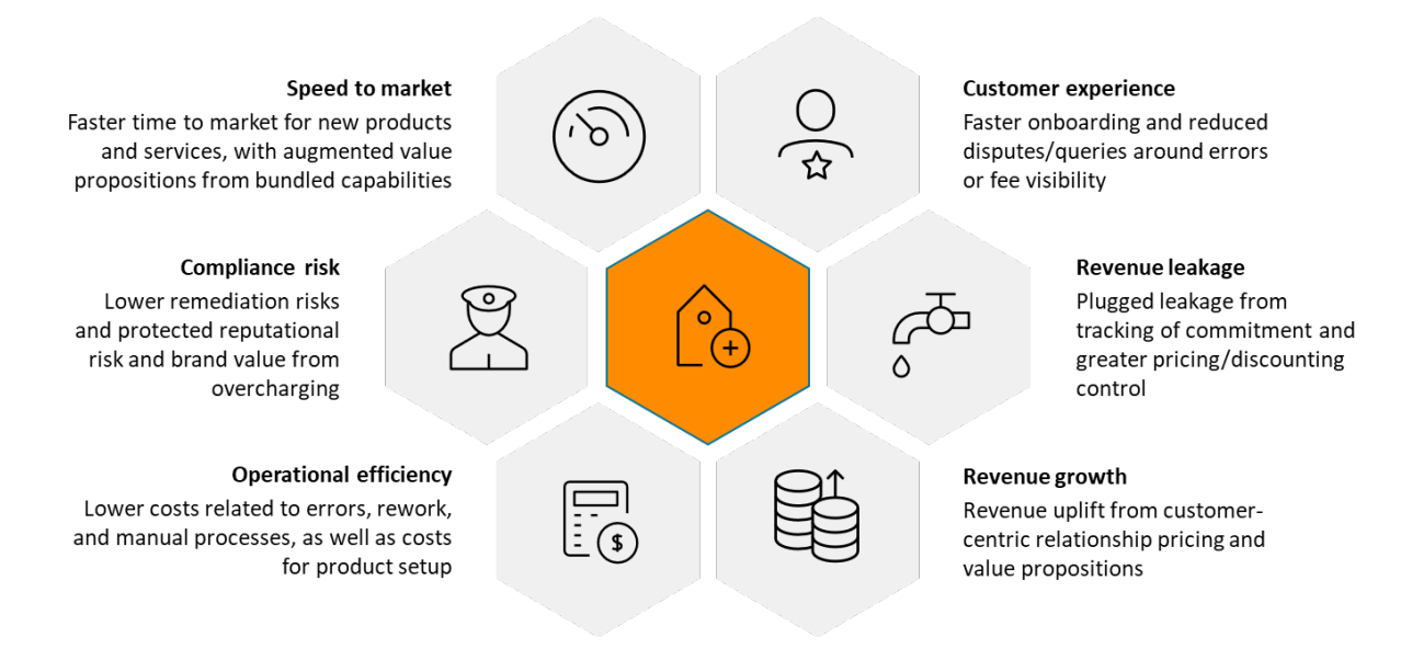
Figure 3: Benefits of Enterprise Pricing and Product Management

The concept of enterprise product and pricing shifts pricing and product management away from design and implementation within individual core banking systems toward enterprise services. These provide centralized capabilities around the product catalog, loyalty, relationship pricing, product bundling, product development and management, and billing. Importantly, these enterprise services don't only support internal products and services; they also allow banks to create and manage value propositions that comprise both internal and third party products and services.